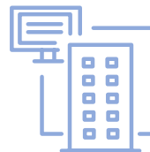
Building Automation Systems (BAS)